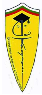
FENCING ACADEMY “V. ETROPOLSKI”