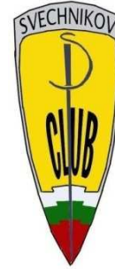
FENCING CLUB “N. SVECHNIKOV”