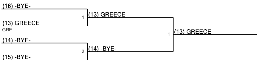
Table of 2 (Pl. 13-14)