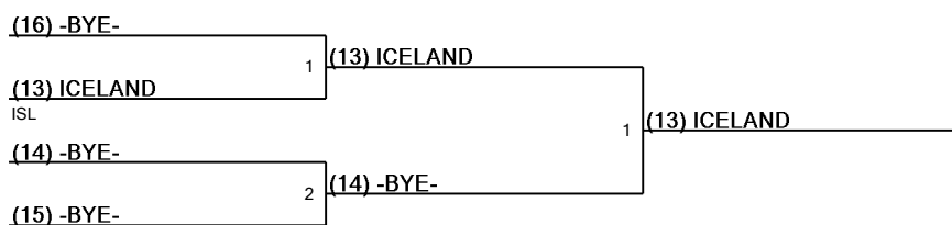
Table of 2 (Pl. 13-14)